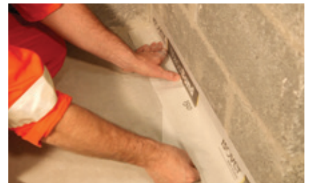
Floor to wall junctions